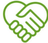
USHERS & GREETERS