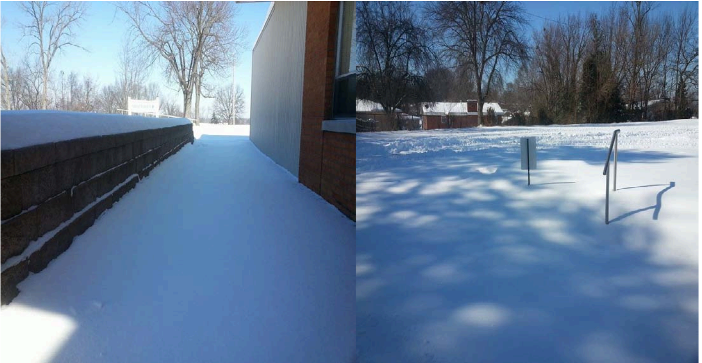
The church and our 12 inch snow fall.