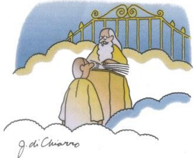
"What are the last four digits of your Social Security number?"

For our pastor's 50th birthday , the congregation decided to give him a new suit.