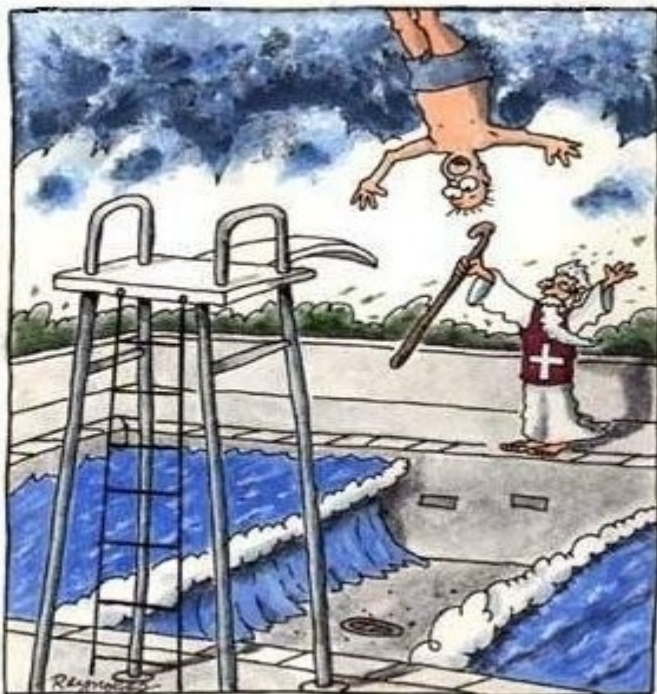
Moses' first and last day as a lifeguard.