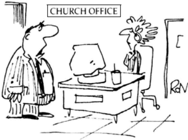
"If telemarketers call, invite them to church."

the kings and queens were in Biblical times. But there is a higher power. Who can tell me what it is?" Tommy blurted out, "I know, Aces."