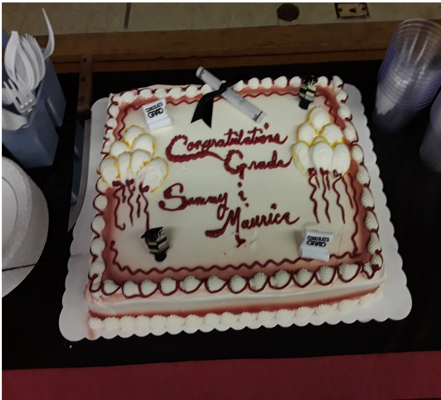
Yummy Graduate Cake enjoyed by all